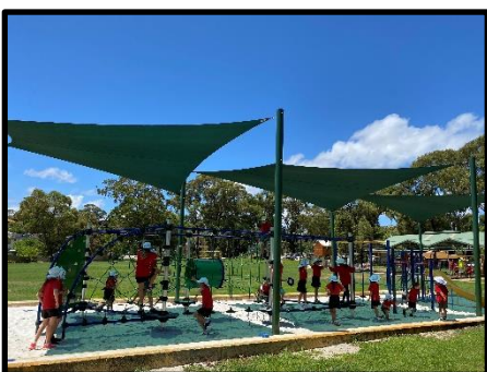
City Beach Primary School

At City Beach Primary School our motto Achieving Together with Pride and our three core values of Respect, Responsibility and Resilience are integral to all that we do.